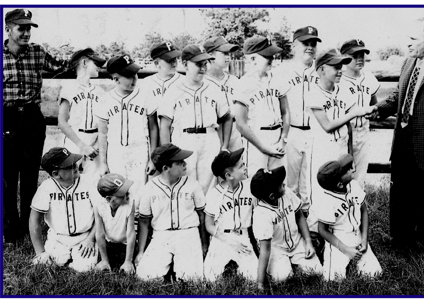
MEMBERS OF THE LITTLE LEAGUE PIRATES OF 1965 MEET THE BASEBALL LEGEND -- CASEY STENGEL